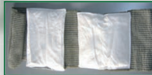
For entry and exit wounds