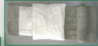
For extra absorbency