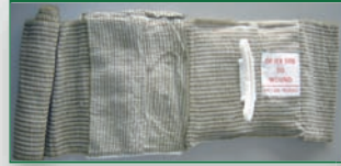
A second, mobile pad